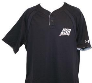
USA Shooting T-shirt