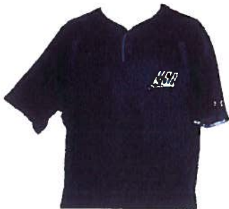
USA Shooting T-shirt