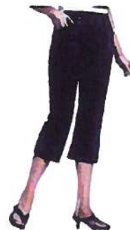
Women's navy pants (Dockers); Women's navy shorts (Chaps); Women's navy capris (Chaps)