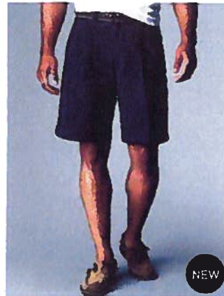
Men's navy shorts (Dockers)