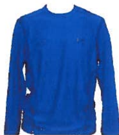
USAS Long Sleeve T-shirt