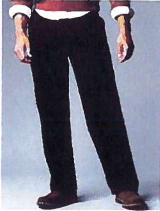
Men's navy long pants (Dockers)

Examples of acceptable pants, shorts, and shirts for the official team uniform: