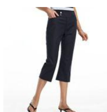
Women's navy pants (Dockers); Women's navy shorts (Chaps); Women's navy capris (Chaps)