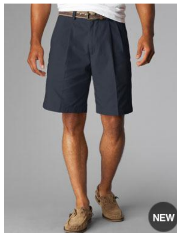
Men's navy shorts (Dockers)