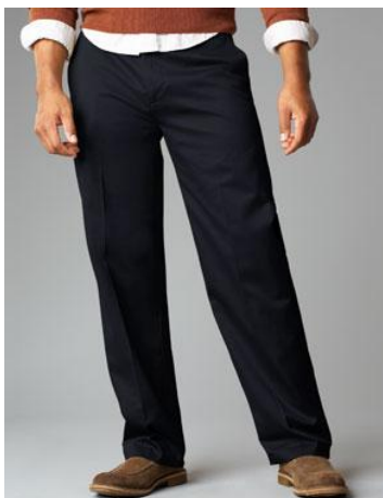
Men's navy long pants (Dockers)

Examples of acceptable pants, shorts, and shirts for the official team uniform: