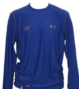
USAS Long Sleeve T-shirt