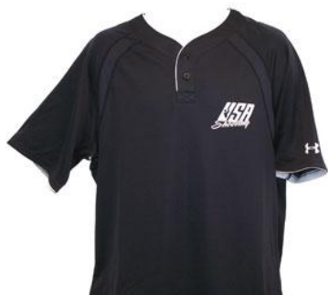
USA Shooting T-shirt